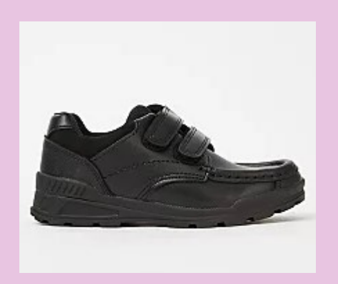
Year 11 Students